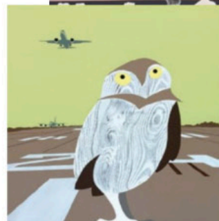
RIGHT, TOP TO BOTTOM: Artist Hilary Baker's 2022 piece Night (Fox); Baker's Burrowing Owl , LAX (2019).